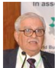
Co-chair, TERI-BCSD India

Business is in a key position to positively influence the future of sustainability agenda. The corporate sector should test their entire growth strategy against the emerging reality of climate change and the social compulsion to restrict GHG emissions. They may not face this challenge now. But they will in the lifetime of the plants and facilities and market presence they are establishing.