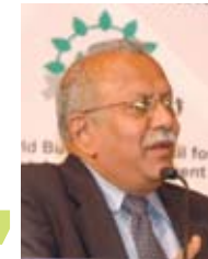
Chair, TERI-BCSD India

TERI-BCSD India has a mission that is of enormous value to Indian society. The time has come when industry and business together look to what they can do for society and government rather than what society and government can do for them. In that spirit, TERI-BCSD India has been functioning as a platform for socially conscious corporations as they work towards the goal of sustainable development.