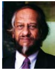
President, TERI-BCSD India Dr. R K Pachauri , Director General, TERI

TERI-BCSD India has a mission that is of enormous value to Indian society. The time has come when industry and business together look to what they can do for society and government rather than what society and government can do for them. In that spirit, TERI-BCSD India has been functioning as a platform for socially conscious corporations as they work towards the goal of sustainable development.